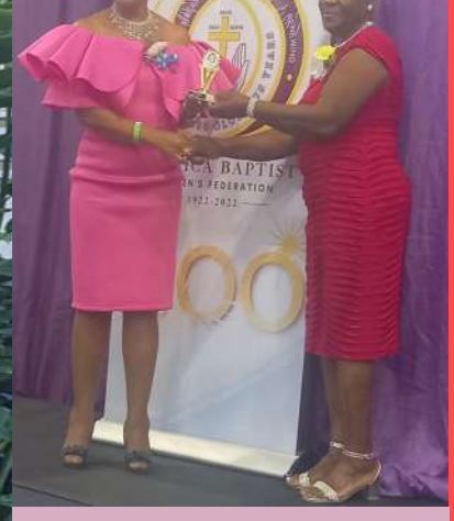
service over the years.

One of the many awardees receiving recognition for her contribution to the JBWF.