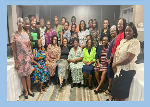
Women of the CBWU at the recently held Executive meeting, Miami, Florida.