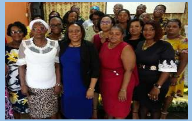
Madam President and the TTUBWA women.