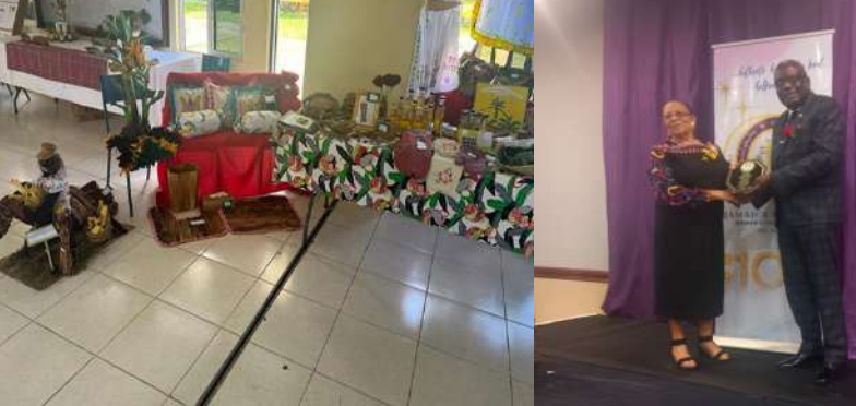
Craft display at the Conference.